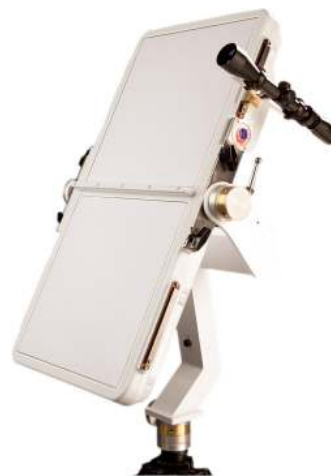
BR-29015 Doppler Radar