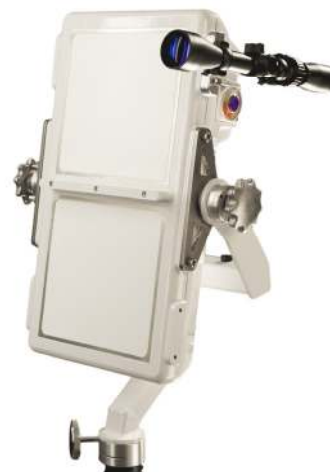
BR-1001 Doppler Radar