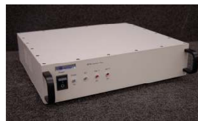
JB-6e Junction Box (data acquisition)